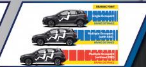
Electronic Brakeforce Distribution (EBD)