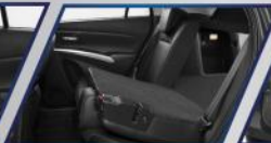
60:40 Rear Seatback