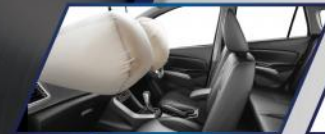
Dual SRS Airbags