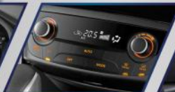
Auto Climate A/C