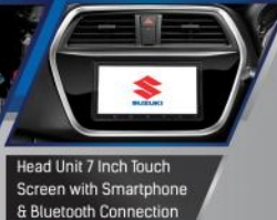
Head Unit 7 Inch Touch Screen with Smartphone & Bluetooth Connection