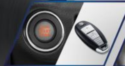
Engine Start/Stop Button & Keyless Entry