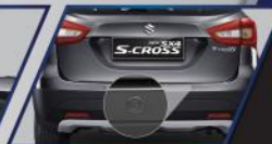
4 Point Parking Sensors