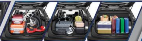
Large Luggage Capacity