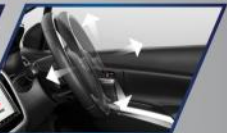
Telescopic and Tilt Steering