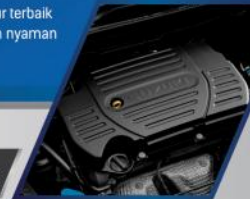
M15A, DOHC, VVT, 1491 cc

New SX4 S-CROSS berikan fitur-fitur terbaik di kelasnya. Membuat Anda semakin nyaman dan menikmati eksplorasi Anda.