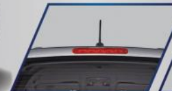
High Mount Stop Lamp