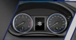
Attractive MID Design