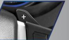
Paddle Shift (for AT)