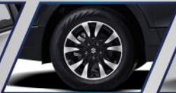
Black Polished Alloy Wheels 215/60 R16