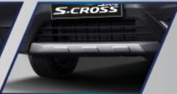
Skid Plate with Silver Accent (Front, Side, Rear)