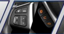
Audio Switch Control with Bluetooth Phone Connection