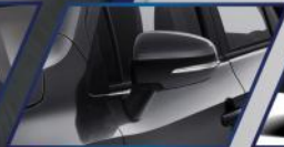
Electric & Foldable Mirror with Turn Signal Lamps