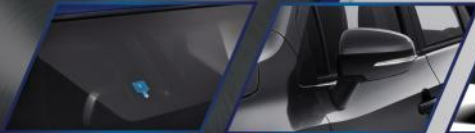
Auto Rain Sensor