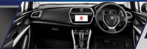
Elegant & Modern Instrument Panel & Dashboard

Masuk ke dalam kabin New SX4 S-CROSS, kesan lapang, stylish, modern, dan premium langsung menyambut Anda. Ditambah dengan detail ornamen berkelas di tiap sisinya.