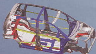
TESS Body (Total Effective Strength Structure)